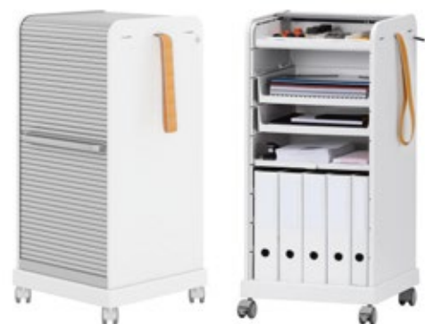
Follow Me 2