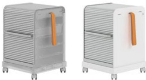
Follow Me 1

shutter. Both models can be individually configured with optional drawers and shelves. The higher Follow Me 2 version makes an ideal companion for standing-height tables.