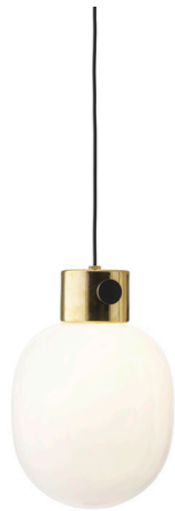
Polished Brass 1820839